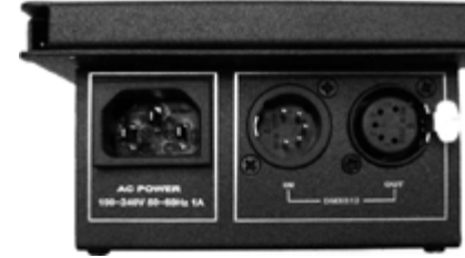
Figure 1 Power & DMX Connections

Immediately after receiving power, the DMX Iris Unit may go through a homing cycle, ending in a full open or closed position of the iris.