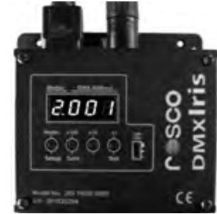
Figure 2 Digital Display pad

If no DMX signal is present, the digital display will indicate “LOST” and “512” in alternating sequence. If a DMX signal is present, the display will indicate both the operation Mode and the current DMX address of the Iris. (Figure 2) In this example, the DMX Iris is set to Mode 2 and DMX Address 001.